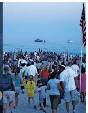
TWA 800 10 Yr. Memorial, Long Island