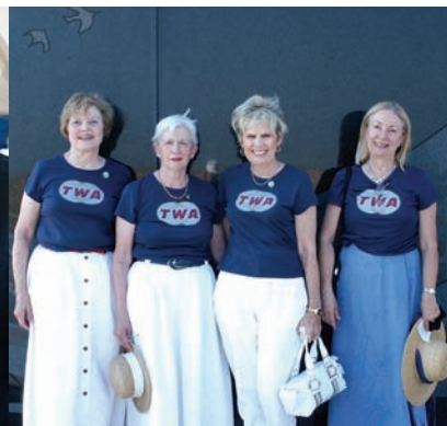
Former TWA employees honor lost friends & co-workers