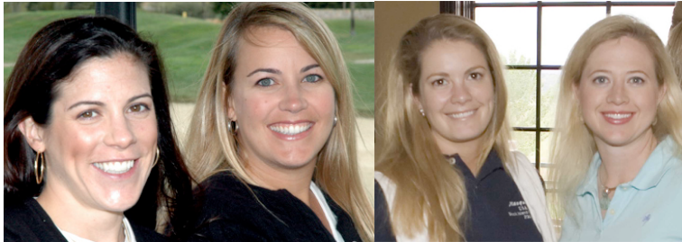
Junior League & ACCESS Volunteers helping out at the ACCESS “Hearts, Clubs & Aces” Tournament