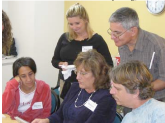
Volunteer Grief Mentor training in NYC